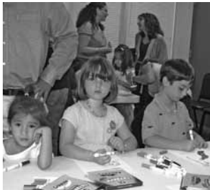
Children making decorations for the Sukkah.

The Education Committee has planned a full year. We hope parents become not only actively involved in their child's Jewish education, but also a part of our ever-growing Jewish community!