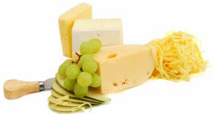
Wine, non-alcoholic beverages, cheese and fruit.