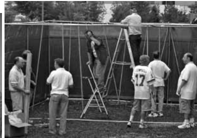
Volunteers building the Sukkoh