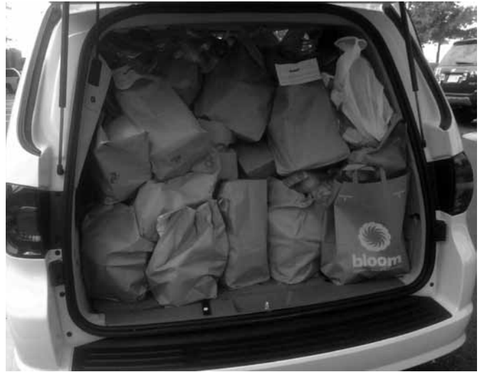
Beth Chaverim families generously donated 1,250 pounds of food to Loudoun Interfaith Relief this holiday season.